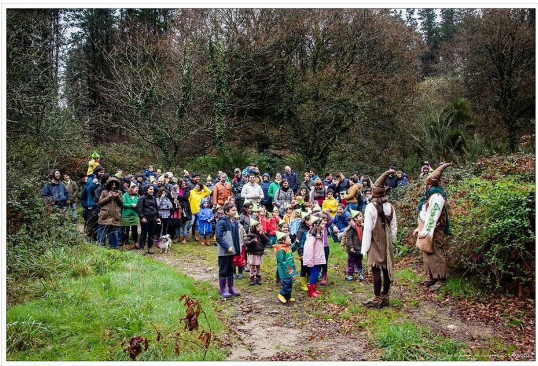
The first "Montescola" action in March 2016